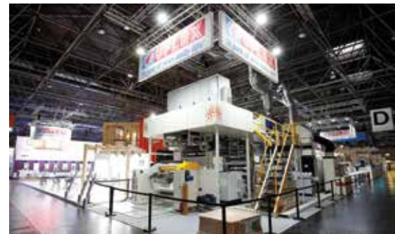
The UFlex stand at drupa 2024

According to him, the CI flexo press is designed to address the pressing need for printing low-gauge and thin-gauge flexible films with precision and accuracy, thereby offering sustainable options for flexible packaging. In the video walk-through of the stand, Chaturvedi said the 'Made in India' press serves the high-